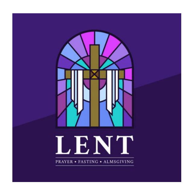
The Second Sunday in Lent March 16, 2025