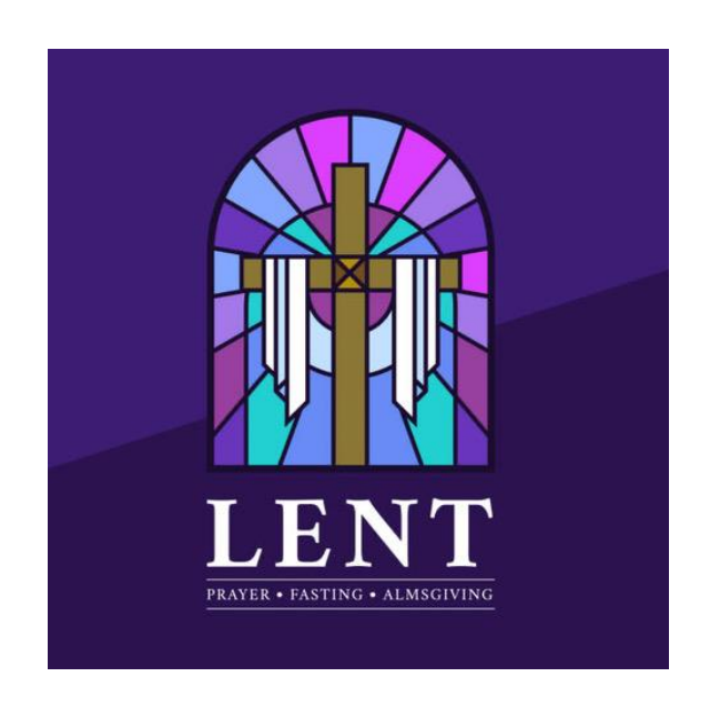
The First Sunday in Lent March 9, 2025