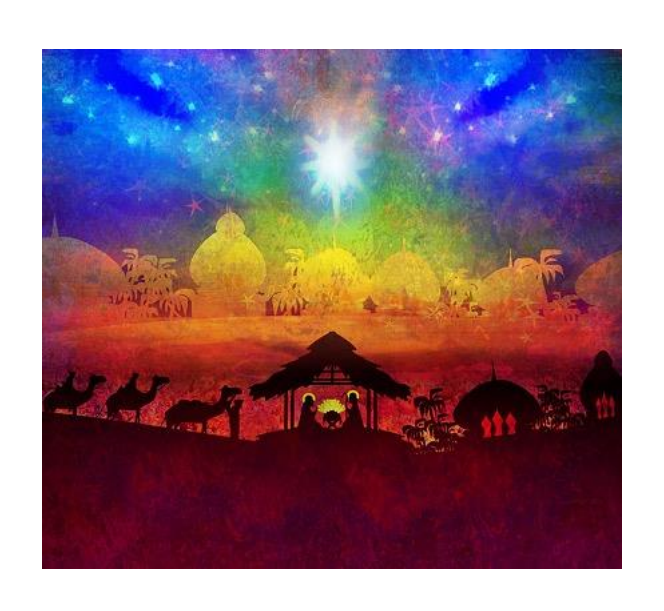
Seventh Sunday after the Epiphany February 23, 2025