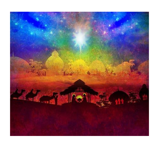
Second Sunday after the Epiphany January 19, 2025