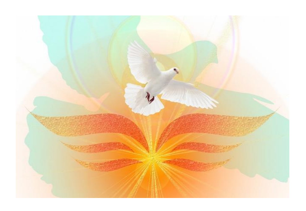
The Twenty Second Sunday after Pentecost October 20, 2024