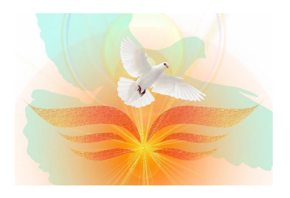
The Twentieth Sunday after Pentecost Blessing of the Animals October 6, 2024