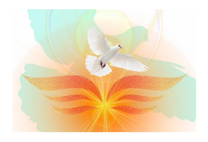
The Seventeenth Sunday after Pentecost September 15, 2024