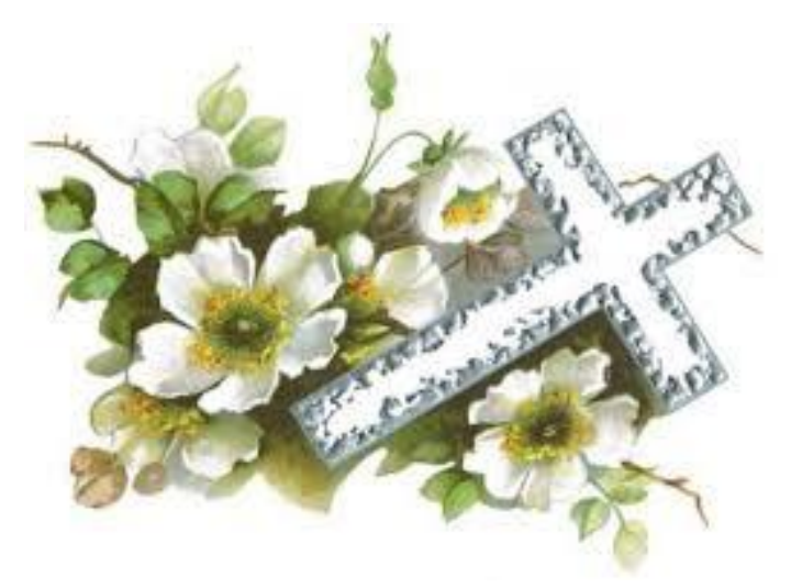
Fifth Sunday of Easter April 28, 2024