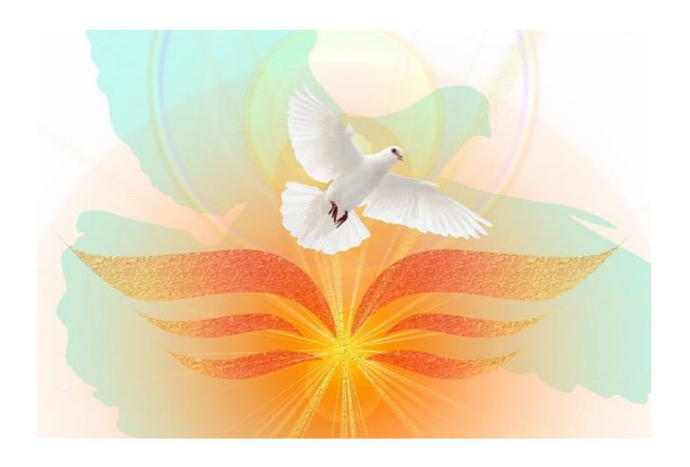
The Season of Pentecost Morning Prayer Service